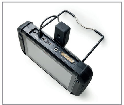
The Smart Programmer connects to the rear of the Smart Pro via the USB cable

The Smart Pro guides you step-bystep through the programming procedure. You can read data either from the OBD cable, which is always connected to the vehicle when programming, or from the ignition unit using the key emulator.