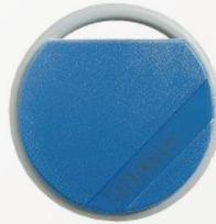
BTICINO (All colours)