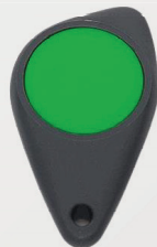
KMS HS (High Security) *

*KMS HS FOB: This is a dual frequency fob. To copy it, you can't use the single button but need to use the Read option from the menu and select. 1. M1 S50 1K 4B then once read you can select Write. This copies the HF part of the fob. To copy the LF part Select Read from the menu then 39. T5577 and once read select Write.