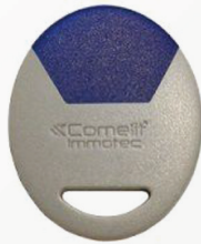
COMELIT (All colours)