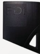
FDI (All colours)