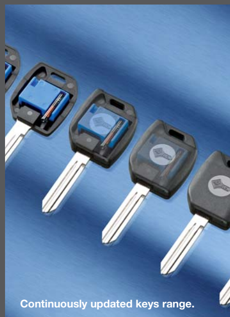
Continuously updated keys range.

SILCA S.p.A. Via Podgora, 20 (Z.I.) - 31029 Vittorio Veneto (TV) - Italy Telephone +39 0438 9136 Fax +39 0438 913800