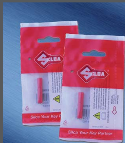
1-piece easy-to-stock package.